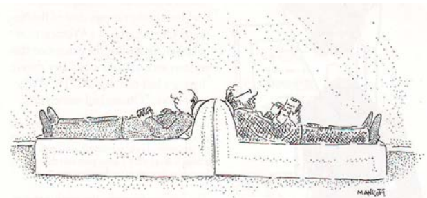
"Look, you're not the only one with problems."